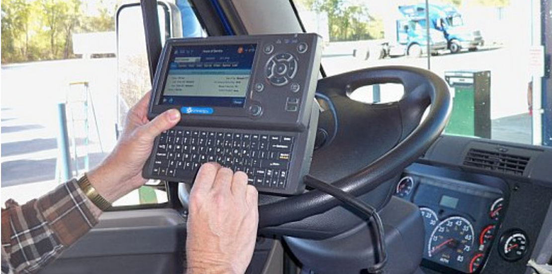
Omnitracs' Mobile Computing Platform 200 (MCP200).

“This application puts a face in front of drivers, which talks to them in a much more personal and timely manner,” says Benusa.