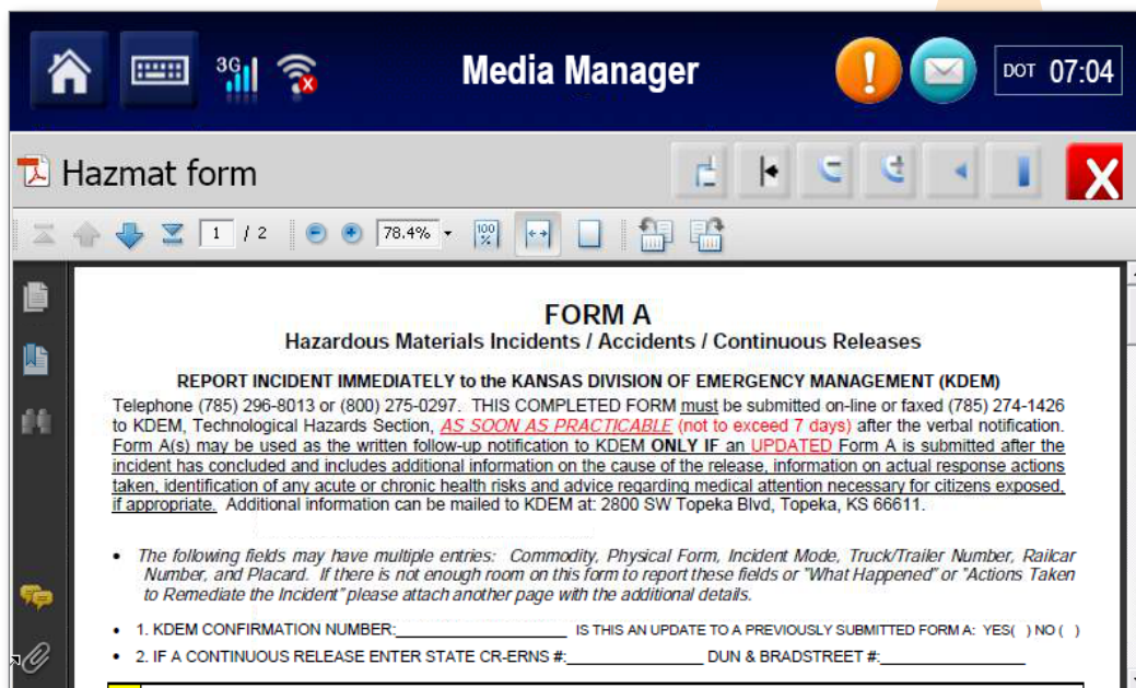
PDF delivery ensures that drivers have access to important documents.