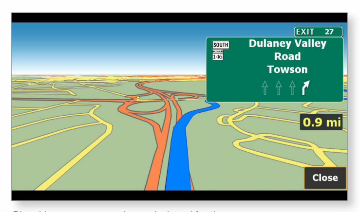
Give drivers a user experience designed for them

Enable your drivers through easy-to-read and up-to-date maps with semi-annual, over-the-air map, software, and data updates via your cellular network.